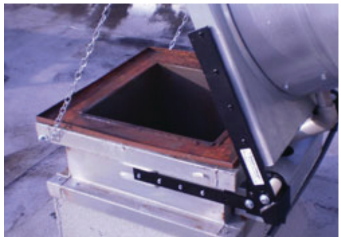
QF - Quick Fit version

The Quick Fit Super Hinge is available in sizes capable of hinging fans with bases from 10 inches square to 45 inches. If a fan base exceeds these sizes, custom hinging systems are available. Contact Hoodfilters.com for more information.